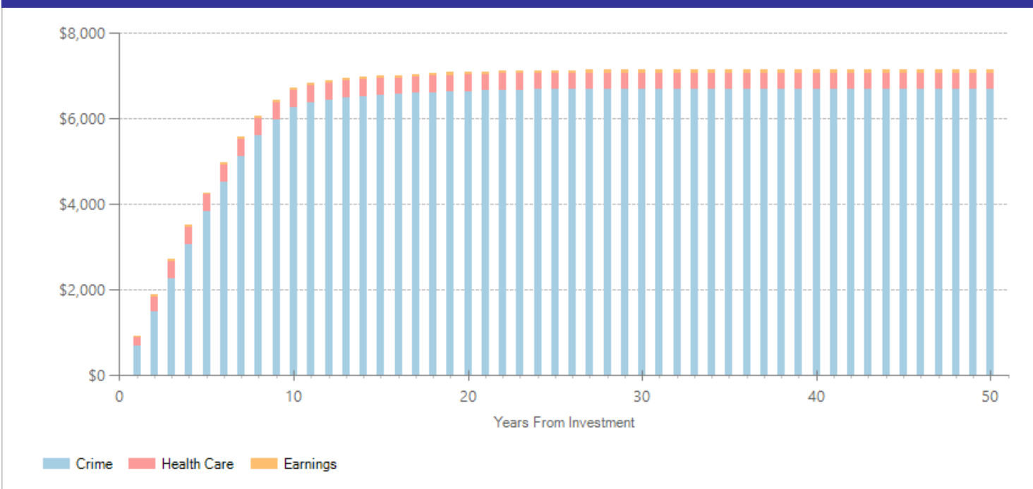
Taxpayer Benefits by Source of Value Over Time (Cumulative Discounted Dollars)

The graph above illustrates the breakdown of the estimated cumulative benefits (not including program costs) per-participant for the first fifty years beyond the initial investment in the program. These cash flows provide a breakdown of the classification of dollars over time into four perspectives: taxpayer, participant, others, and indirect. "Taxpayers" includes expected savings to government and expected increases in tax revenue. "Participants" includes expected increases in earnings and expenditures for items such as health care and college tuition. "Others" includes benefits to people other than taxpayers and participants. Depending on the program, it could include reductions in crime victimization, the economic benefits from a more educated workforce, and the benefits from employer-paid health insurance. "Indirect benefits" includes estimates of the changes in the value of a statistical life and changes in the deadweight costs of taxation. If a section of the bar is below the $0 line, the program is creating a negative benefit, meaning a loss of value from that perspective.